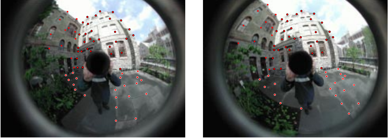
Figure 2: Two images taken with the same parabolic catadioptric camera. Points are those used for correspondence. Points highlighted in white are on the ground plane; points highlighted in black are on one side of the building facade.

makes estimating depth more error-prone. In two views with such small motion, the reconstruction performs remarkably well.